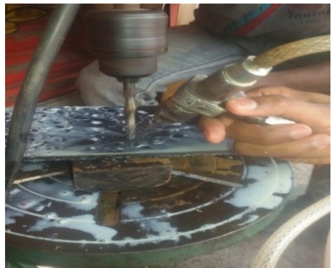
(a) MQL set up (b) Operation performing on MQL