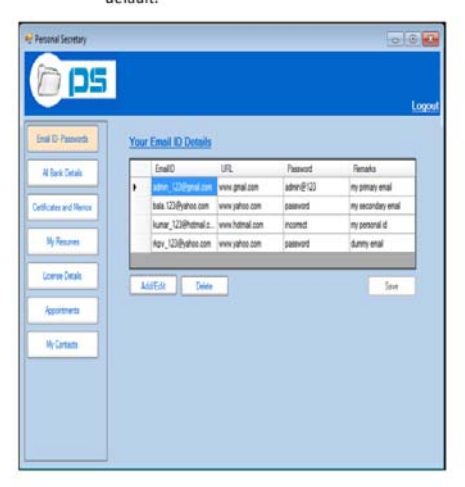
Figure 1 : PS Product Screen IV. STYLECOP

StyleCop is an open source SCA tool from Microsoft that checks. NET code for conformance of several design guidelines defined based on Microsoft's .NET Framework [1][7]. StyleCop evaluates the style of C# source code in order to enforce both a set of style and consistency rules. Style guidelines are rules that specify how source code should be formatted and dictate whether spaces or tabs should be used for indentation and the format of for loops, if statements and other constructs [5]. The goal is to define guidelines to enforce consistent style and formatting and help developers avoid common pitfalls and mistakes. StyleCop contributes to this maintainability by encouraging consistency of style, which in turn makes it easier for developers to pick up existing code and work with it productively, and by encouraging plenty of documentation for future developers to read thereby improving the long term maintainability of the source.[6] Historically, different development groups have used drastically different coding styles. Many teams have