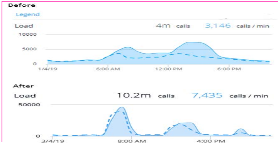
Figure 2: # Transaction Volumes per minute increased on old to new

The Figure 2 graph below, denotes # of transactions for "Charge Injection" functionality Before the DTT and After the DTT. The system sustained an increase of almost two and half times load with better processing times. Before the DTT method ~4 millions at the rate of over 3K transactions per minute. After the DTT method over 10 million at over ~7.5K transactions per minute.