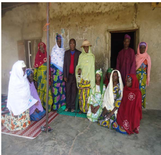
Figure 21 : Magajia's Palace (Gwanara)

Their salary structure is also nothing to write home about. Most of them do not receive up to one tenths (1/10) of their male counterparts' salaries. According to the female king of Ikota, Obabinrin (female king) Celina Folorunsho, while presenting the grievances of women monarchs to Ooni of Ife, said most of them are paid stipends. She said the most highly paid among them earns five dollars ($5); some, two dollars ($2) and others a dollar ($) per month (Visit to Ooni of Ife). See picture below. These situations are attributable to their lack of influence which sound western education brings.