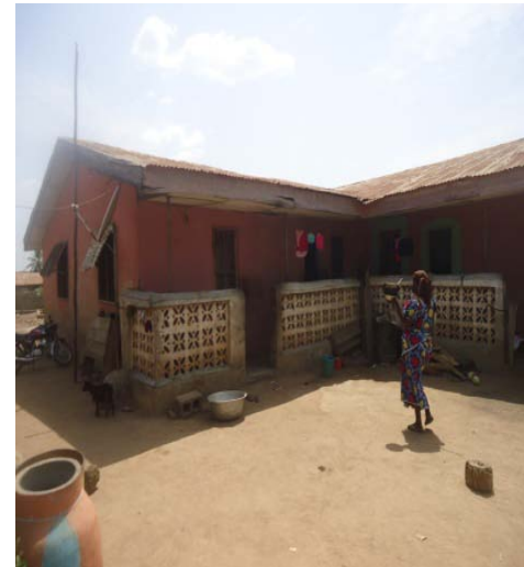
Figure 23 : Buyonkafo's Palace (Ilesha Baruba)