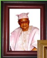
OBABINRIN (FEMALE KING) EBI EBI OKE-OSO, OYO STATE