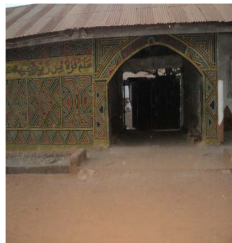
Figure 18 : Emir's Palace (Okuta)