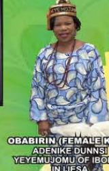
OBABINRIN (FEMALE KING) ADENIKE DUNNSI OKE-OSO, OYO STATE