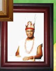
OBABINRIN (FEMALE KING) ALU IBIYAM OKE-OSO, OYO STATE