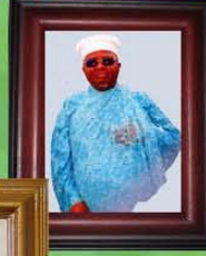
OBABINRIN (FEMALE KING) ADENIKE DUNNSI OKE-OSO, OYO STATE