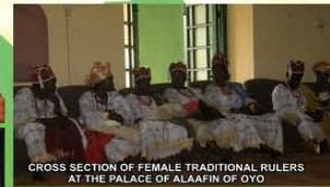
CROSS SECTION OF FEMALE TRADITIONAL RULERS AT THE PALACE OF ALAAFIN OF OYO