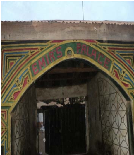
Figure 20 : Emir's Palace (Gwanara)