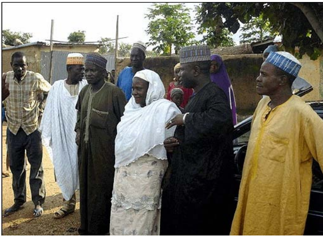
Figure 3 : Female Emir Hadisa Muhammad in the midst of Kumbada Council of Elders