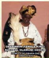
OBABINRIN (FEMALE KING) RACHEL OLAWUMI ODOFIN OKE-OSO, ONDO STATE