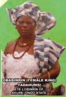
OBABINRIN (FEMALE KING) ADAHUNSI OKE-OSO, OYO STATE