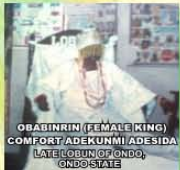
OBABINRIN (FEMALE KING) COMFORT ADEKUNMI ADESIDA OKE-OSO, OYO STATE