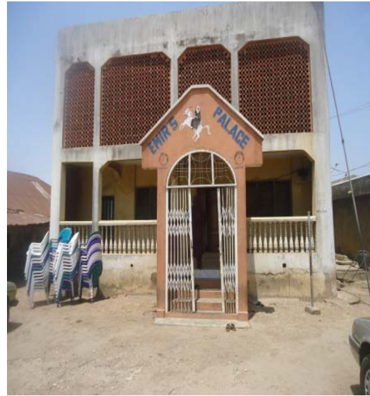
Figure 22 : Emir's Palace (Ilesha Baruba)