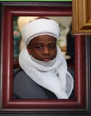
OBABINRIN (FEMALE KING) HELLEN ONOCHIE OKE-OSO, OYO STATE