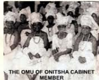
THE OMU OF ONITSHA CABINET MEMBER