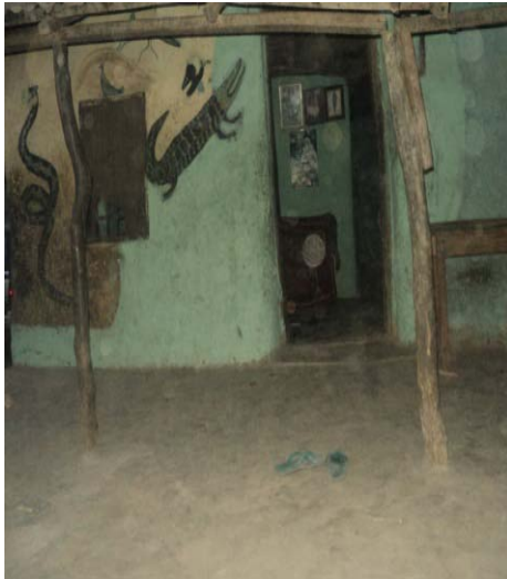
Figure 19 : Yongokogi Palace (Okuta)