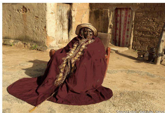
Figure 1 : The female Emir of Kumbada, Hajia Hadisa Muhammad robbed and sitting in front of her palace

and religious leaders of their communities. As a matter of fact ruler-ship by males in these communities is forbidden as any attempt by them always result in mysterious death(The Nation, 2007: 5). Such communities included, Kumbada, ArnadoDebo and Nokowo. In providing pictorial evidence of this, we shall limit ourselves to one of them which is the female emir of Kumbada, HajiaHadisaMuhammed.