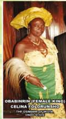
OBABINRIN (FEMALE KING) CELINA FOLOKUNBI OKE-OSO, OYO STATE