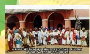
CROSS SECTION OF FEMALE TRADITIONAL RULERS AT THE PALACE OF OONI OF IFE