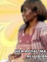
HER ROYAL MAJESTY ALU IBIYAM OKE-OSO, OYO STATE

God will bless your aspiration, Oduduwa will bless your aspiration, I shall also pray for you. I shall discuss your matter with the council of traditional rulers in western part of Nigeria as well as the Governors. ...Ooni of Ife (Arole Oodu'a)