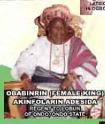
OBABINRIN (FEMALE KING) AKINFOLARIN ADESIDA OKE-OSO, OYO STATE