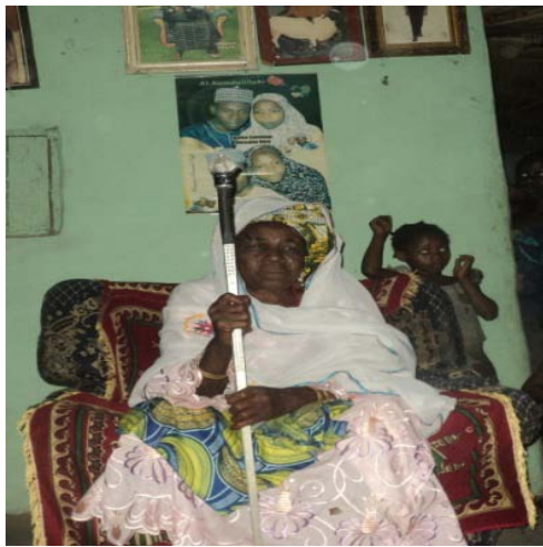
Figure 15 : The Yong The Emir of Okuta Kogi of Okuta