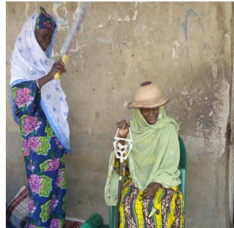
Figure 13 : Kotokotogi II, (OFR) Emir of Gwanara The Magajia of Gwanara