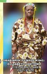
OBABINRIN (FEMALE KING) ELIZABETH ODEYEM OKE-OSO, OYO STATE