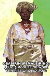
OBABINRIN (FEMALE KING) FELICIA MODUPE OBIWOLE OKE-OSO, OYO STATE