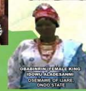
OBABINRIN (FEMALE KING) IDOWU ALADESANMI OKE-OSO, OYO STATE