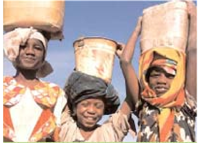
Figure 2 : For some people water collection is a daily need