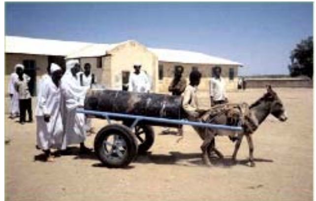
Figure 3 : A typical donkey-drawn water tank used by water vendors