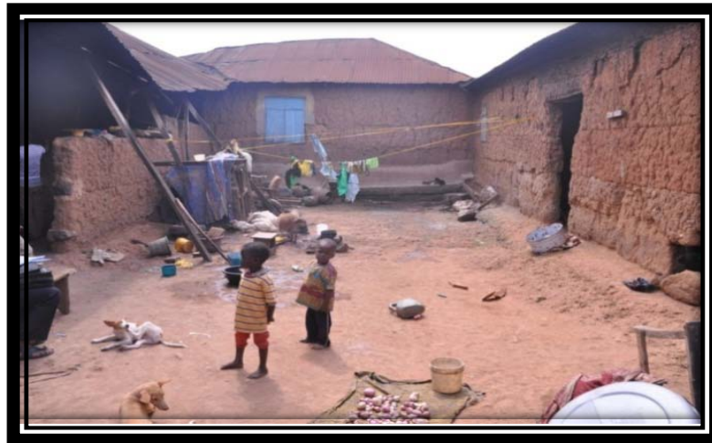
A – Multihabited house (A) Traditional compounds courtyard house

residents responding. See Figure 2 for the pictorial view of some multihabited houses.