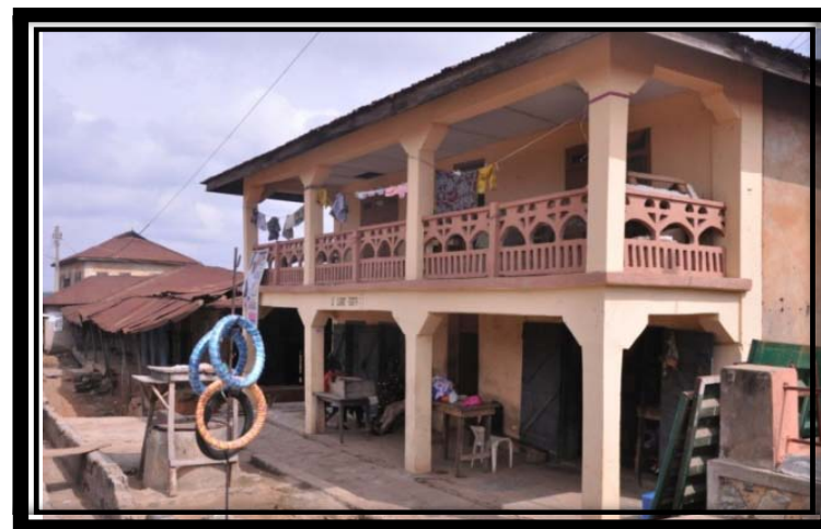
Multihabited House (C). Ghana style- combines both courtyard and rooming.