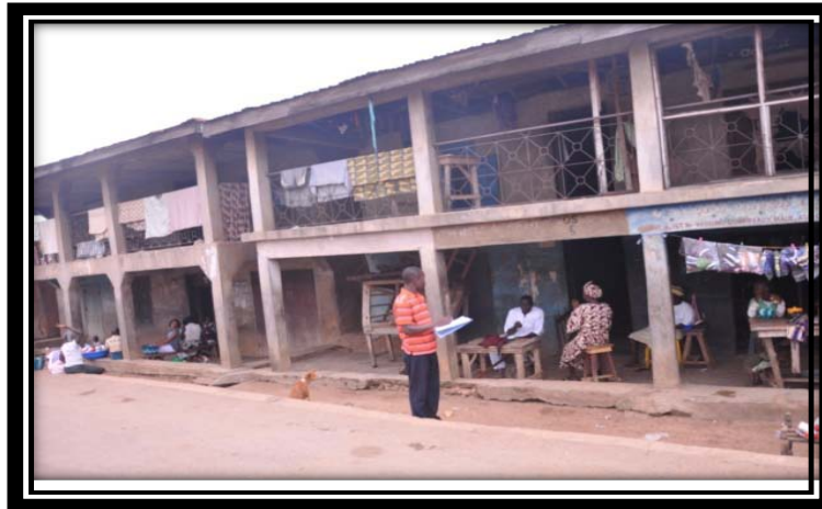
Multihabited house (B) Rooming House or "Face me -I- face-you