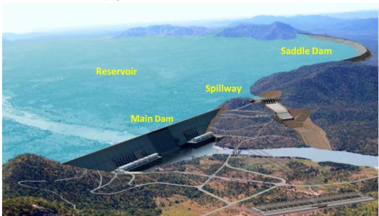
Figure 4: Main Dam and Saddle Dam of GERD

water to the Nile River. Sewilam asserted that some Egyptian researchers are currently working in different concentrations, such as water treatment, water recycling, increased irrigation efficiency, and desalination. El-Baradei also said (HornAffairs, 2016) that the Government of Egypt needs to consider using groundwater wells as a water resource, but only after treating the saltwater. Sewilam, however, believes that the solution ultimately lies in greater cooperation between the Nile Basin's countries to secure water and other natural resources (HornAffairs, 2016). "There should be an integrated Water-Energy-Food Nexus plan for all the Nile Basin countries. We should be thinking of self-sufficiency of resources by complementing each other, as for example, we need to identify the countries in the Basin which can generate energy and other countries which can supply water and also the countries that can make use of water and energy to produce enough food for the whole basin" (HornAffairs, 2016). "I think the lack of trust, cooperation, and participatory long-term planning between all the Nile Basin's countries are the main reasons for the current situation" (HornAffairs, 2016). "The main Dam is allocated for generating electricity while the side Dam is just for water reserves and it won't affect the power generation process of Ethiopia if the amount of the reserved water is reduced" (HornAffairs, 2016). The GERD's both main and saddle dams are shown in Figure 4.