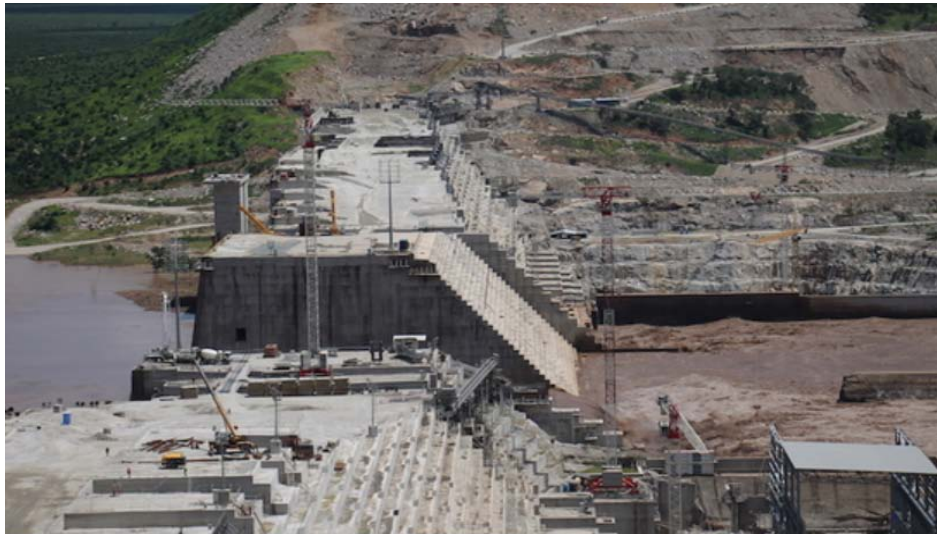
Figure 3: Overview of GERD on July 31, 2016

The Italian company (Salini Costruttori) was awarded the project which has already worked on other projects such as the dams of Gilgel Gibe II, Gilgel Gibe