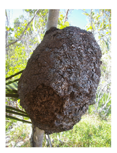
Figure 1: Mexican termites maintain constant temperature inside the center of mound while ambient conditions vary dramatically. The axis of the mound indicates an afternoon time of heat flow reversal (see explanation in Figure 2).