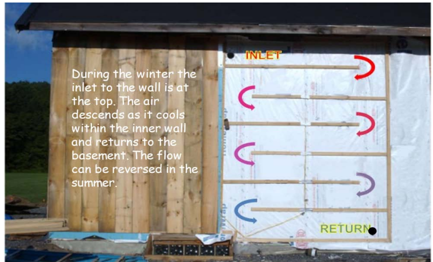
Figure 5: Cavity between existing wall and added interior insulation in wood frame construction is used for convective heating or cooling.

and effective. Conversely, air transfer shown in Figure 5 required a sophisticated control to operate and showed stratification of temperature in vertical direction by as much as 5 - 6 °C during a cold winter day.