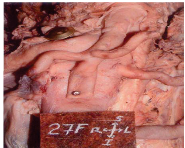
Figure 2- Typical trifurcation of coeliac trunk into left gastric artery, common hepatic artery and Splenic artery.

According to Moncada et al [7], 89% of the coeliac arteries divide into left gastric, common hepatic and splenic arteries but variations in the arrangement are quite common. Vandamme and Bonte [11] in their angiographic study showed that only 86% of coeliac trunk showed the classical trifurcation whereas Michels [10] stated this percentage to be only 55%.