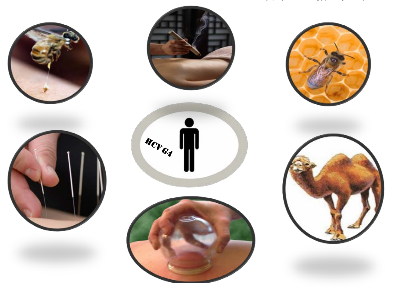
Figure 1 : showing different traditional medicine used in Egypt especially in Saharan and Sub-Saharan regions for the therapy of chronic diseases especially those with HCV genotype 4

Use of camel milk or drinking copious amounts of urine with or without moxibustion by fire, acupuncture and cupping, especially in the Saharan and Arabian areas, is currently popular in Egypt (figure 1).