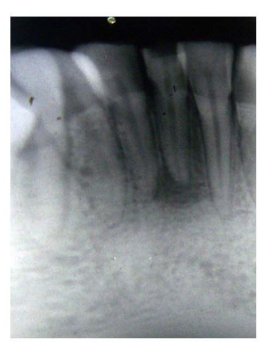
Figure 2: Periapical radiolucency with 31

Under the rubber dam isolation, access opening was done with 31 and samples were collected for both aerobic and anaerobic culture so that effective antibiotic treatment was started. Working length was determined with apex locator (Root ZX; Morita, Tokyo, Japan.) and confirmed with intra-oral periapical radiograph. Cleaning and shaping was completed with step-back technique using hand K-files (Dentsply Maillefer, Ballaigues, Switzerland). Chlorhexidine (Endo-CHX, Prime Dental Product, Mumbai, India.) was used as intracanal irrigant and not sodium hypochlorite, duo the risk of apical extrusion of the irrigant. Canal was dried with paper points and calcium hydroxide (RC Cal; Prime Dental Products, Thane, India.) was placed within the canal as intracanal medicament. After a week obturation was completed using gutta-percha points with cold lateral condensation technique (Figure 3). Patient was evaluated for a period of 3 months showed complete healing of extraoral sinus (Figure 4). Intra oral periapical radiograph showed complete healing of periapical radiolucency (Figure 5).