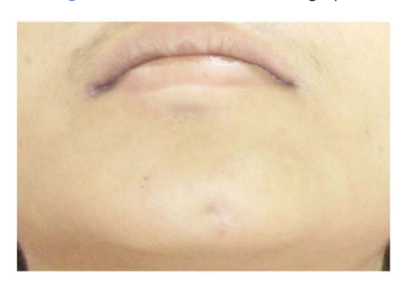
Figure 4: Complete healing of extra-oral sinus