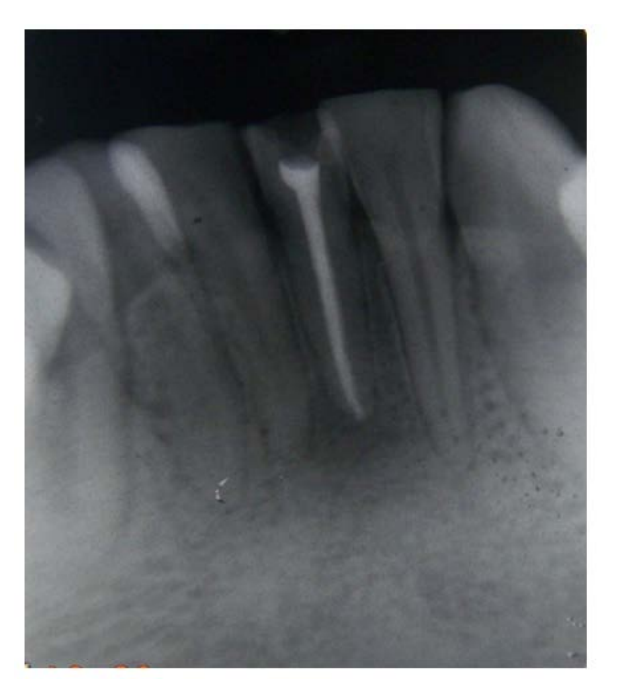
Figure 3: Post-obturation radiograph

Under the rubber dam isolation, access opening was done with 31 and samples were collected for both aerobic and anaerobic culture so that effective antibiotic treatment was started. Working length was determined with apex locator (Root ZX; Morita, Tokyo, Japan.) and confirmed with intra-oral periapical radiograph. Cleaning and shaping was completed with step-back technique using hand K-files (Dentsply Maillefer, Ballaigues, Switzerland). Chlorhexidine (Endo-CHX, Prime Dental Product, Mumbai, India.) was used as intracanal irrigant and not sodium hypochlorite, duo the risk of apical extrusion of the irrigant. Canal was dried with paper points and calcium hydroxide (RC Cal; Prime Dental Products, Thane, India.) was placed within the canal as intracanal medicament. After a week obturation was completed using gutta-percha points with cold lateral condensation technique (Figure 3). Patient was evaluated for a period of 3 months showed complete healing of extraoral sinus (Figure 4). Intra oral periapical radiograph showed complete healing of periapical radiolucency (Figure 5).