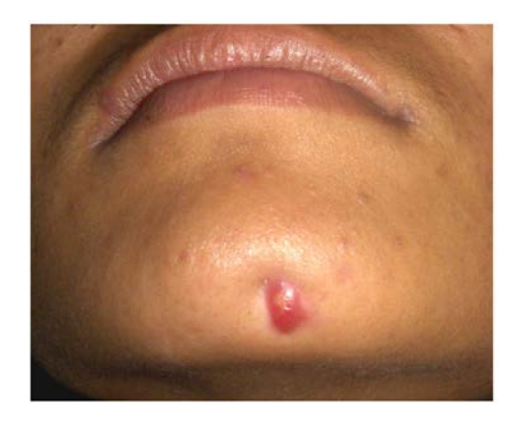
Figure 1: Extra-oral sinus on chin

A 17 year-old female patient was referred to the Department of conservative dentistry and endodontics with a complaint of extra oral nodulous growth on her chin for the past five months. Patient had given a history of treatment for the same nodule from dermatologist since its appearance but not subsided. On extraoral examination, 0.5×0.5 cm nodule like lesion (Figure 1) was present on her chin. Palpation elicited nontender nodule and fixation of the lesion to underlying bone. Intraoral examination revealed no mucosal lesions or buccal sulcus swelling but elicited tenderness at the root apex of 31. Pulp vitality showed negative response with 31. Periapical radiograph of mandibular left central incisor revealed periapical radiolucency (Figure 2). While recording the dental history patient revealed that she met with trauma two years ago, but there was no pain present with any of the tooth. On clinical and radiographic examination, chronic apical periodontitis with 31 leading to extraoral sinus tract was made. Root canal treatment was planned with 31.