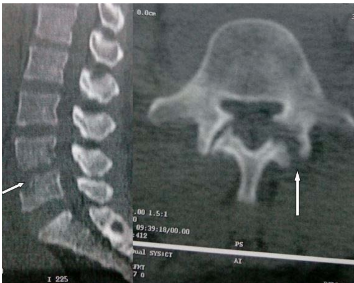
Figure 1 : Lumbar CT scan showed L4-L5 spondylodiscitis and left zygapophyseal arthritis at the same stage CT (patient 1)