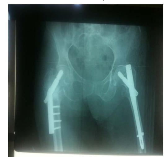
Figure 3 : DHS plate for treatment of trochanteric fracture right not Displaced