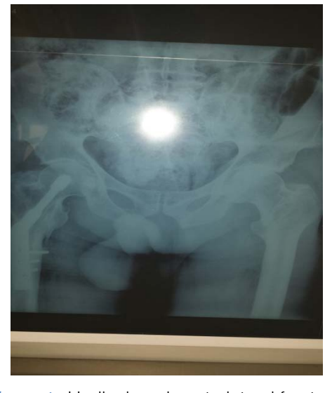
Figure 4: Undisplaced contralateral fracture