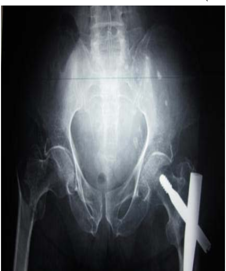
Figure 2: Bilateral fracture of the trochanter (decline of neck screw)