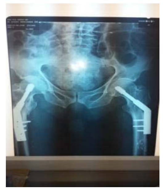
Figure 1: Bilateral fracture of the trochanter (DHS plate)