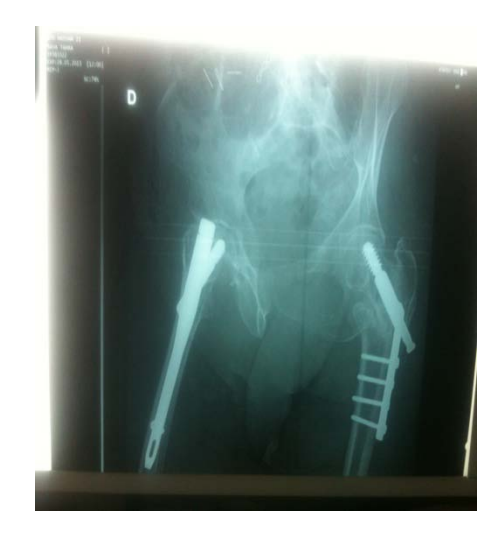
Figure 6: Consolidation of both fracture sites