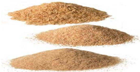
Figure 1 : Saw Dust