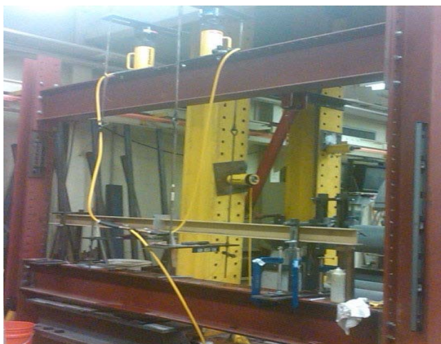
Fig. 2: Experimental test setup

The experimental and theoretical maximum loads P_e and P_t , respectively, are presented in Table 1 in addition to their ratios for a 4x2x0.25 in. I- shaped FRP cross section with length L equal to 60, 72, 84, 96 and 108 inches, respectively. The value of (L - 2a) , that is, the distance between the two applied loads P and P shown in Figure 1 was kept constant at 24 inches. The Young's ( E_{11} ) and shear ( G_{12} ) modulus values of the FRP beam material were 2,550 ksi and 420 ksi, respectively.