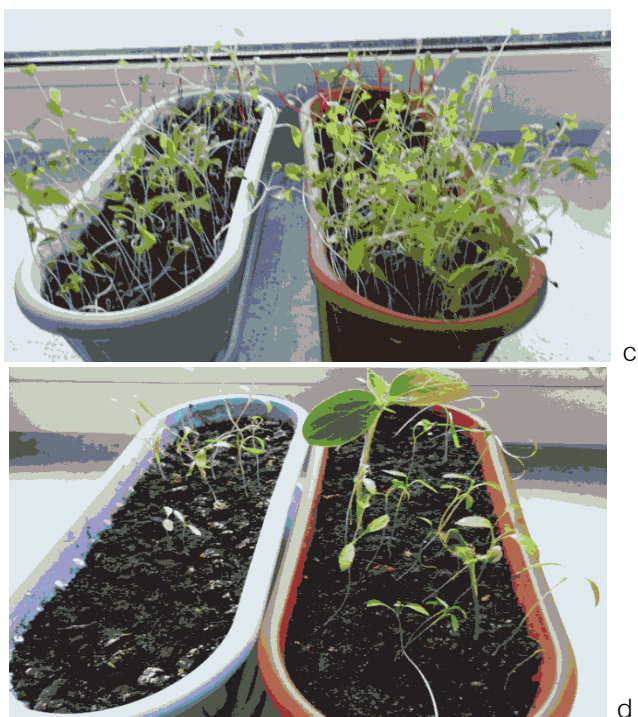
Figure 1 : The indoor plants after 0 (a), 19 (b) and 30 (c) days correspondingly; (d) is the next plants after 19 days in the same soils with the same watering procedures. The plants in a right (brown) flower pot were watered by solution with ions CO 3 2- ; HCO 3 - ; K+.

The experimental plants are beetroots (10 grains), carrots (20 grains), and much number of parsley (2 Grams) in each of plant pots, see Fig.1 (a, b, c). The second experiment was done later with the same soil after deleting previous plants; the next portion were planted, there are 20 grains of dill and 5 grains of cucumber for each plant pot. The same watering process was repeated regularly every day during February 2014, results are presented at Fig.1d. One can see a strong vegetation growth by enriched solution watering according to proposed method for all studied plants.