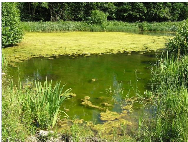
Figure 3: The aquatic environment with algae Dinobryon (Třeboň, Czech Republic).

dangerous not only for aquatic plants and animals but also for humans. For example, such an aqueous environment with algae Dinobryon and Surirella from the site (Třeboň, Czech Republic) are shown in Figures 3 and 4. It is generally known that defined algae absorb carbon dioxide and emit oxygen, thus playing an important role in preserving life on Earth.