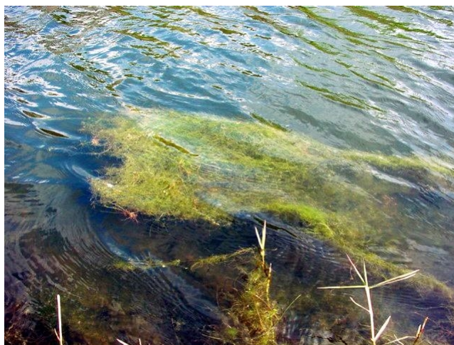
Figure 4: The aquatic environment with algae Surirella (Třeboň, Czech Republic).