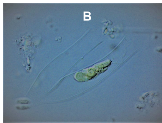
Figure 1: SEM micrograph of the: A - Non-activated sample algae Dinobryon and activated sample sulphide concentrate, B - Mechanochemical activated sample (sulphide concentrate and algae Dinobryon), gold nanoparticles attached in algal cells