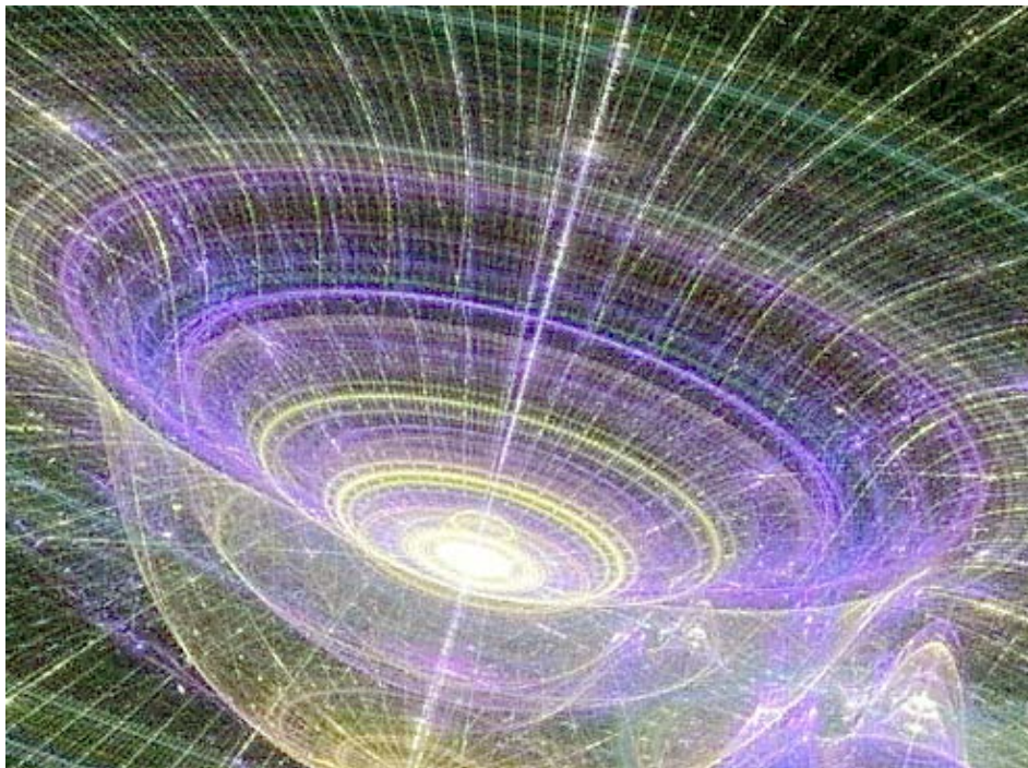
Fig. 1: Original EXCLUSIVITY

The philistine opinion now dominant on Earth that SCIENCE is needed EXCLUSIVELY by scientists, to whom the philistine counts EXCLUSIVELY star-studded ones, is fundamentally erroneous. It is now, unlike the beginning of the 20th century, that is leading humanity